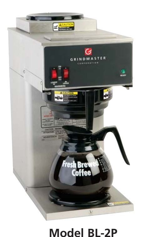
(Decanters sold separately)